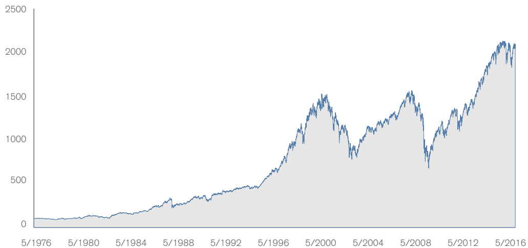
Chart 2: S&P 500 Index - Dividend Adjusted Value

Let me borrow some excellent work from another investment firm that has occupied the upper floors of the market’s grand hotel for many years now. GMO’s Ben Inker in his first quarter 2016 client letter makes the point that while it is obvious that a 10-year Treasury at 1.85% held for 10 years will return pretty close to 1.85%, it is not widely observed that the